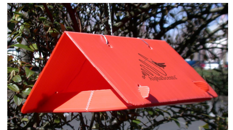
Multi-season red plastic Delta Trap (also available in white plastic or convenient single use red paper trap)