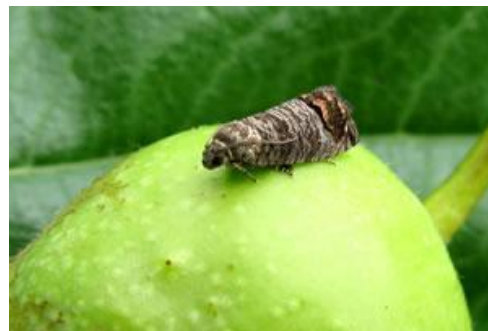
Fig 1: Male codling moth, apple and pear damage†