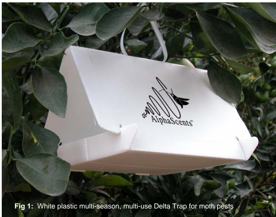
Fig 1: White plastic multi-season, multi-use Delta Trap for moth pests