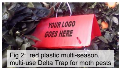
Fig 2: red plastic multi-season, multi-use Delta Trap for moth pests

Call now to find out how. Minimum quantity applies.