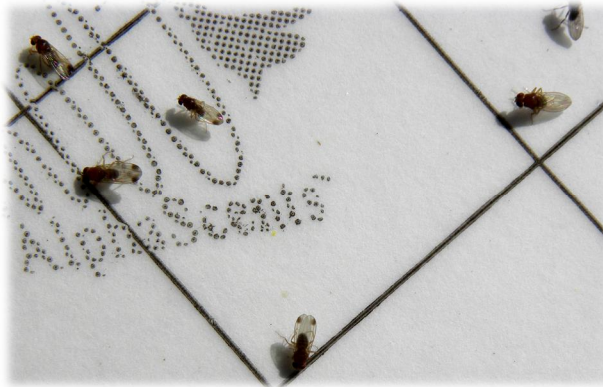
Similar results using white color plastic delta trap liner or wing trap bottom.

SWD are attracted by the lure and stick to the trap as shown. Center photo is capture after only 2 hours. Right photo is capture after 24 hours in rain.